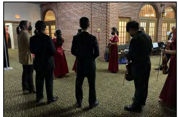
Right: Espressivo at the IMU