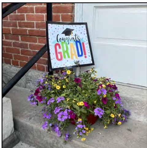
Flowers greeted graduates and their guests