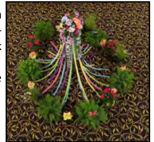
May Pole created by the Preucil Guild

Our return and all that it represents, has been very special and will not soon be forgotten. We look forward in 2022-23, to return to Hancher and Opstad Auditoriums for our performances..