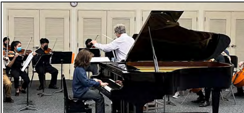
Halloween Play-Ins Piano Workshop Concerto Day