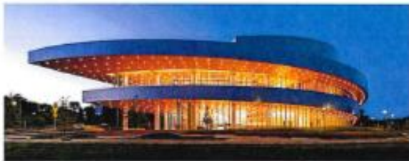
Student Entrance – Strauss Hall door #3